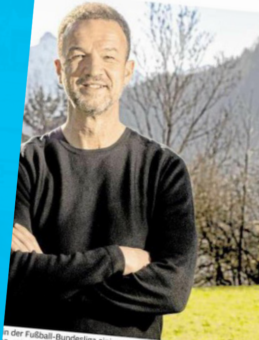
der Fußball-Bundesliga einiges erlebt. Im Rahmen seiner Tätigkeit für 3-Jährige nun nach Bad Hindelang.

Karrieretipp für den Fußball-Profi w er erstmals konkreter über die eigene